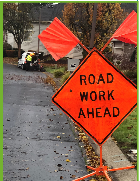
Pictures from left to right: removing debris out of the right of way to allow safe passage of pedestrians; relocation of art sculpture to WES transit station; inspection of sewer pipes via close circuit television.