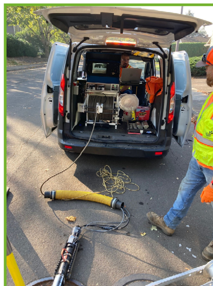
Videeing the clean line