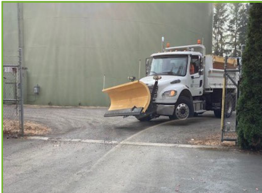
Preparing the winter weather truck

The Roads team attended the American Public Works Association (APWA) Street Maintenance and Collection Systems Fall School in Newport, OR. Staff took courses on integrated vegetation management (IVM), which focused on best practices to manage and approach invasive plant species and general right-of-way vegetation management. Our crew enjoyed the Oregon Department of Transportation's seminar about winter weather readiness, including plowing, sanding, and de-icing.