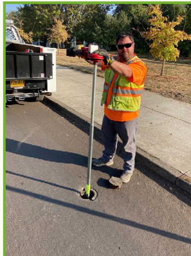
Actuating the valve

In addition to valve exercising, the crew has been furiously prepping and painting fire hydrants before the wet weather brings this activity to a halt.