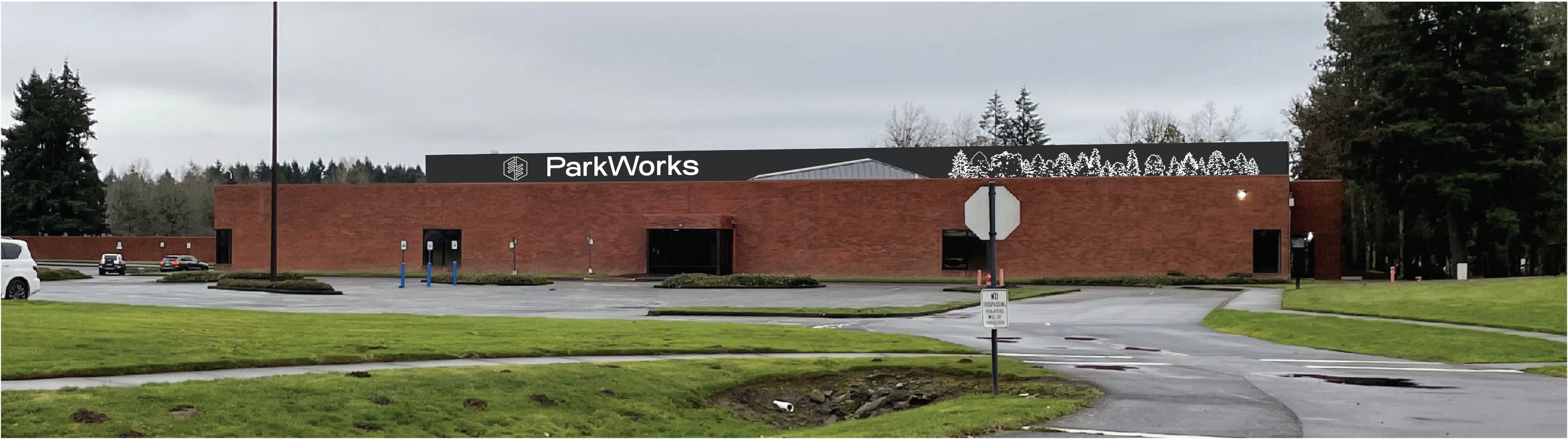
2 Photo Overlay Scale: NTS